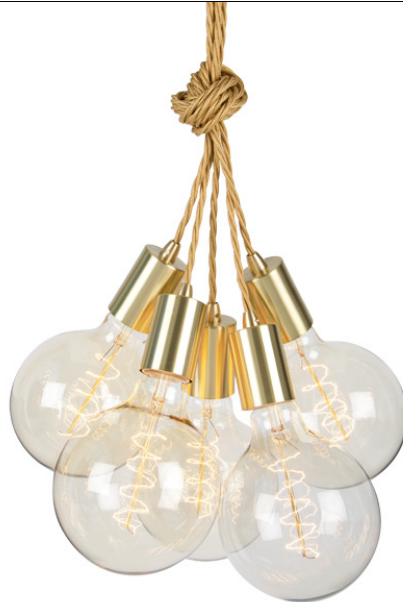
Hoi P'loy © 2016. All Rights Reserved.